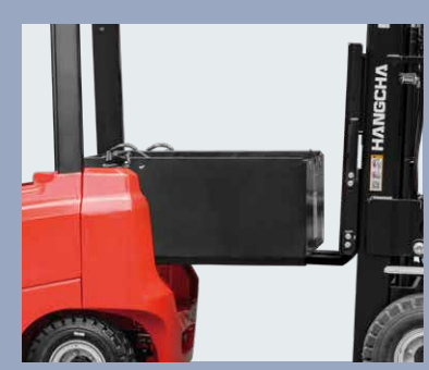
The battery can be removed from the rear enables the battery to be replaced more flexibly (Only for the lead-acid battery)