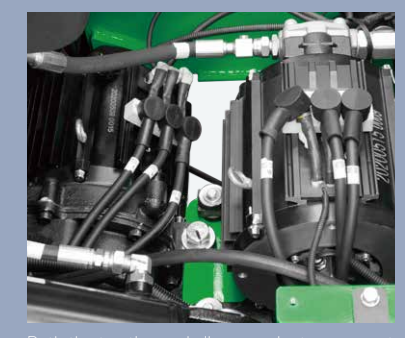
Both the traction and oil pump adopt permanen magnet synchronous motors for the Enpower controller