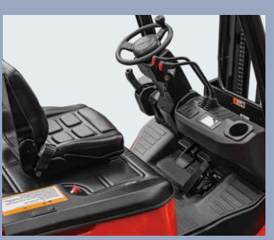
he truck is ergonomically designed to provide a