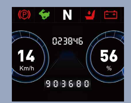
Multifunctional color screen instrument with graphical interface design is simple and intuitive for operator