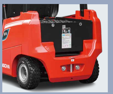
Battery is placed at the rear of the truck